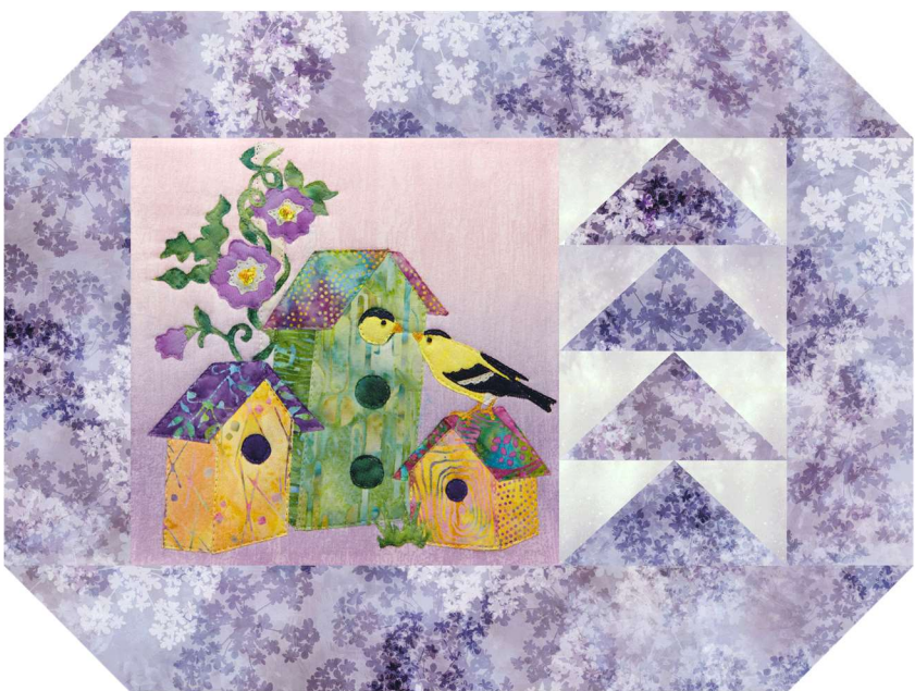
HTH04-P Honey, I'm Home!