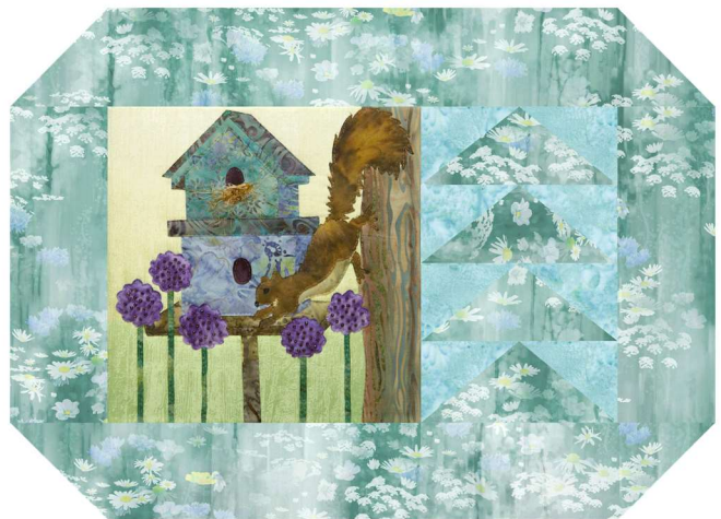
HTH09-P Nosy Neighbor