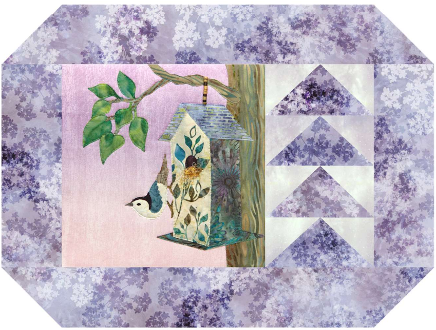
HTH06-P House Hunting